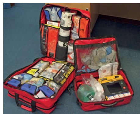
First aid equipment carried by RNLI lifeguards