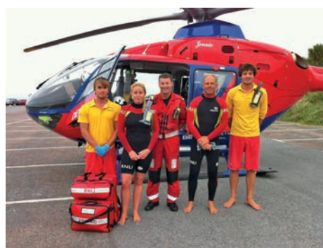
Devon Air Ambulance with RNLI Lifeguards at Bigbury

For more information visit ● www.rnli.org.uk/beachsafety ●