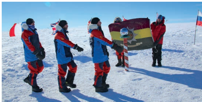
The three wounded Royal Dragoon Guards march to the Pole

When they reached their destination the three soldiers marched to the Ceremonial Pole, saluted their Regimental Colours, and everyone stood for a