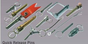
Quick Release Pins