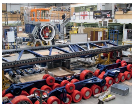
The L&RV production line at Dunkerswell

she is positioned on a slope. In rougher seas the whole assembly is driven into the sea and the cradle is also lowered by 400mm. The coxswain times his launch to exit between waves and the thrust of the water jets is deflected by two ducts near the back of the tractor. The ability of the cradle to be lowered has resulted in cost savings as some lifeboat stations will not have to be altered as much to accommodate the new lifeboat.