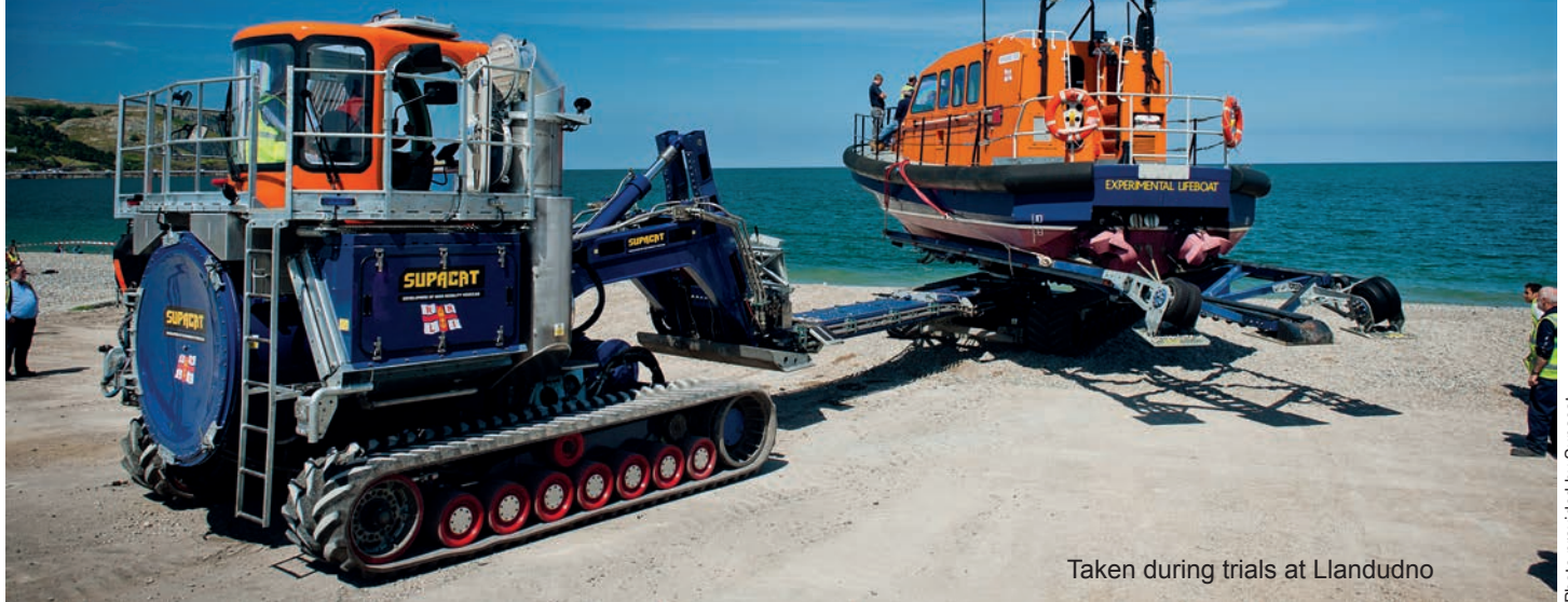
Taken during trials at Llandudno