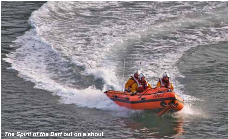
The Spirit of the Dart out on a shout