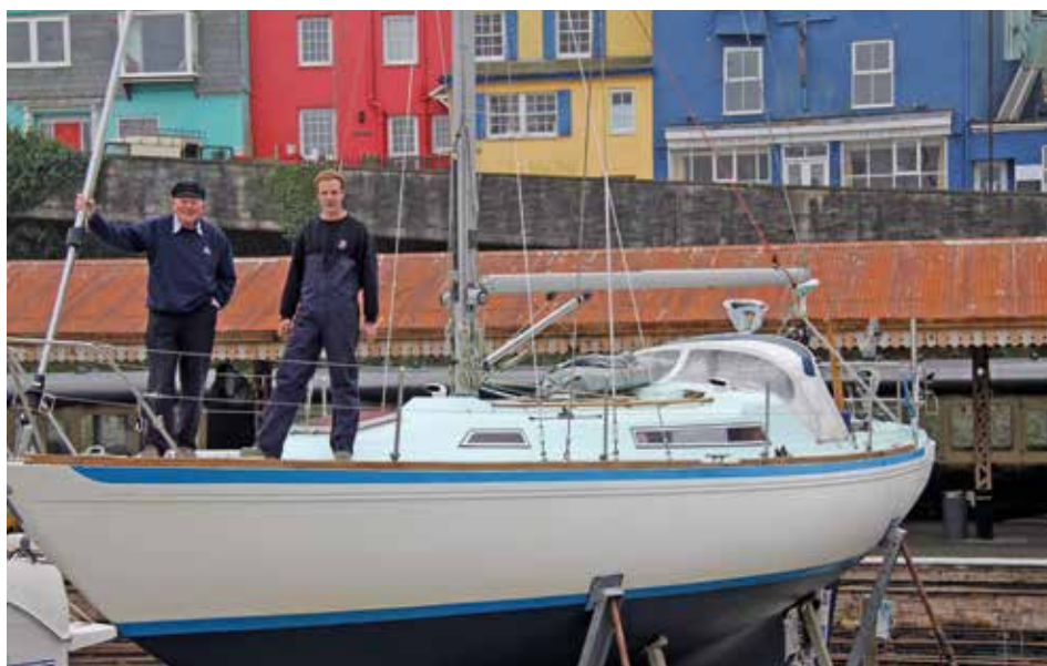
Fitting out at Darthaven