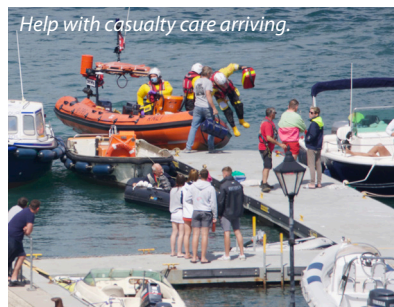
Help with casualty care arriving.

At the time of writing the last two call outs have been to serious casualties who fell on their boats. A Dutch holiday maker fell and suffered a severe injury to her head whilst on her boat moored up the Dart. It required the crews from both inshore lifeboats to transfer her from the yacht to the larger Atlantic 75 lifeboat. On the previous day another holiday maker was thrown against the railings of his boat as they crossed Start Bay and hit rough waves. He suffered a serious shoulder injury and was in severe pain. A paramedic on the RNLI crew took Entonox for the pain and the lifeboat