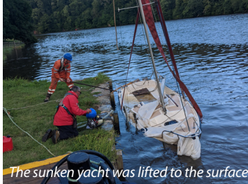
The sunken yacht was lifted to the surface.

The following day an 18ft. day-sailer raised its sails and almost at once capsized. All seven on