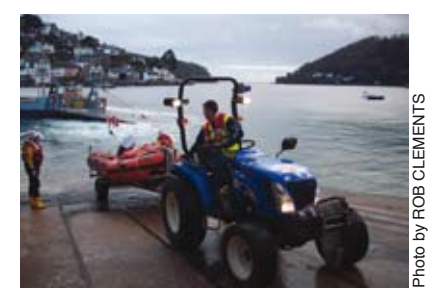
Due to the work being carried out on the Higher Ferry slip the lifeboat has been launched at the Lower Ferry since 28th November 2008

On 8th August 2008 lifeguards reported a small inflatable boat being swept out into Start Bay. The ILB was paged but a passing RIB reached the boat before the ILB was launched and she was stood down. On 10th August 08 the call was to two canoeists seen by the Police in rough water at Totnes. They reached safety four minutes later and the ILB was stood down before she was launched. These call outs should have been included in our totals and so the number of "Launches" is now officially 25.